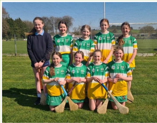
Mini 7s/Rackard League Girls