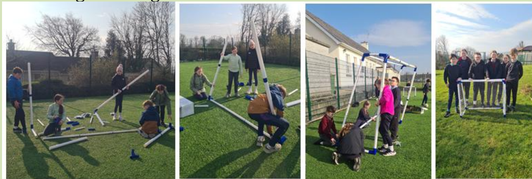
5 th & 6 th Class putting together our new goalposts during Engineers Week