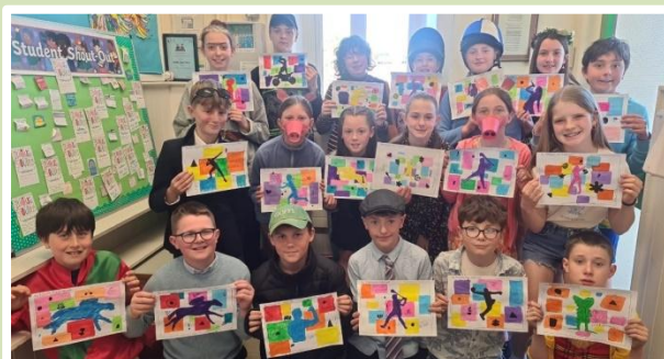
5 th & 6 th Class Art in the style of Henri

Pupils have engaged in an Art2Fund Programme in recent weeks. Each classroom studied the work of a renowned artist and created personalised artwork in the style of that artist. Parents will have an opportunity to purchase their child's piece of art in various forms such as printed on a mug, placemat, keyring etc. There is no obligation to make a purchase but a small percentage of any sales will be returned to the school to fund art materials.