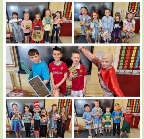
1 st & 2 nd class looking fantastic

Our Annual Readathon concluded just in time for our Easter break when the pupils enjoyed a fabulous day of fancy dress in celebration of its success. Congratulations to all. Over 900 books were read in total over the 5 week period. Ms. Kehoe presented the winning team with their prizes.